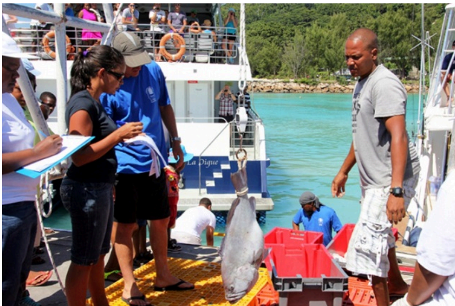
There are no specific regulations governing recreational and sports fishing activities in Seychelles.

These restrictions include a minimum size limit of 32cm for two key species, namely emperor red snapper and green job fish. Additionally, there is a bag limit of 20 fish per person per day for recreational fishers, and a ban on the sale of fish caught by recreational and sport fishers, unless authorised by the SFA.