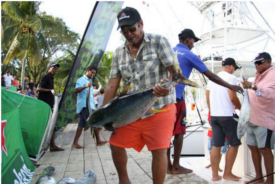
Recreational fishing refers to any fishing activity undertaken by a vessel under 10 metres in length for recreational rather than commercial purposes, like trading or selling.