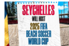
FIFA Beach Soccer World Cup: Seychelles calls for local musicians to create official