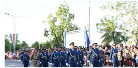
Seychelles celebrates 48th Independence anniversary with traditional National Parade